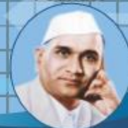
Karmaveer Bhausaheb Hiray